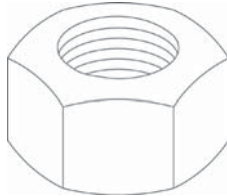
Dimensions • Weights

Order By — Figure number size and finish