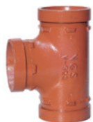
Model V-903 Short-Radius Tee