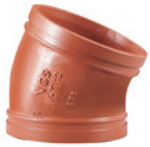
Model V-7112 22-1/2° Elbow