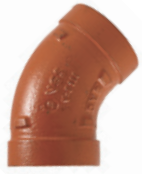
Model V-7111 45° Elbow