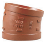
Model V-7113 11-1/4° Elbow