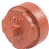
Model V-7160 End Cap