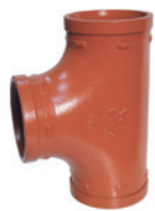
Model V-7120 Tee