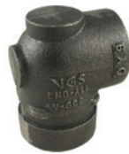
Model V-899 End-All Fitting