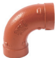
Model V-7110 90° Elbow