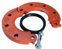
Model V-7041 Flange ANSI Class 125/150