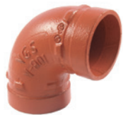
Model V-901 Short-Radius 90° Elbow