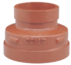
Model V-7150 Concentric Reducer