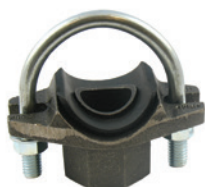
Model V-723 Saddle-Let Mechanical Tee