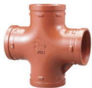
Model V-7135 Cross