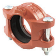
Model V-Z05 Rigid Coupling (angle pad)

Model V-Z05 coupling is also available with flush gap seal gasket. To order, add "F" after model designation of part number (ex. VZ05F-0200).