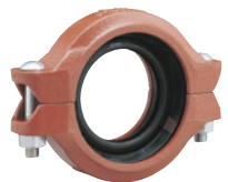
Model V-7706 Reducing Coupling