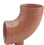
Model V-7110DR 90° Drain Elbow with 1" Outlet