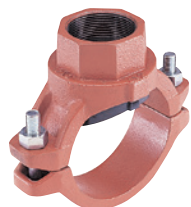
Model V-M21 Mechanical Tee Threaded Outlet