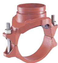
Model V-M22 Mechanical Tee Grooved Outlet