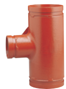
Model V-7121 Reducing Tee