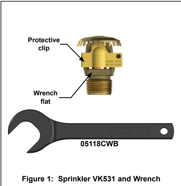
Figure 1: Sprinkler VK531 and Wrench

The Viking Corporation, 210 N Industrial Park Drive, Hastings MI 49058 Telephone: 269-945-9501 Technical Services: 877-384-5464 Fax: 269-818-1680 Email: techsvcs@vikingcorp.com Visit the Viking website for the latest edition of this technical data page: www.vikinggroupinc.com