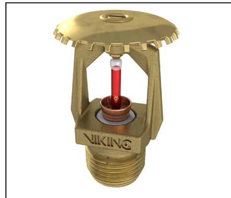
For Light Hazard Occupancies Only

Refer to appropriate NFPA Installation Standards.