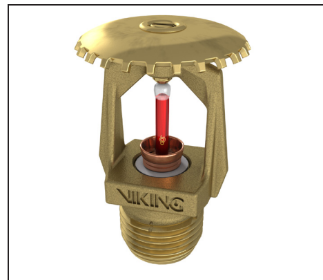
For Light Hazard Occupancies Only

Refer to appropriate NFPA Installation Standards.