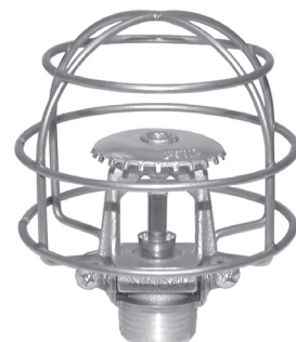
Model D-1 Sprinkler Guard on Upright and Pendent Frame-Style Sprinklers*