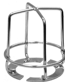
Dry Sprinkler Guard (Order sprinkler guard separately from sprinklers.)